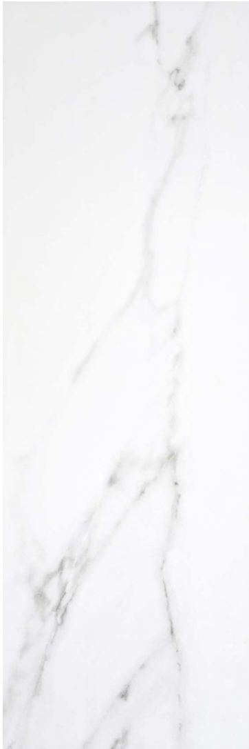
BLANCO Bright Finish

20 x 60 cm (7.88" x 23.63") UN.DM.BLC.0824.BR