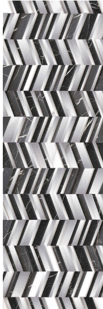
BLANCO DECOR Bright Finish

20 x 60 cm (7.88" x 23.63") UN.DM.BLC.0824.BR