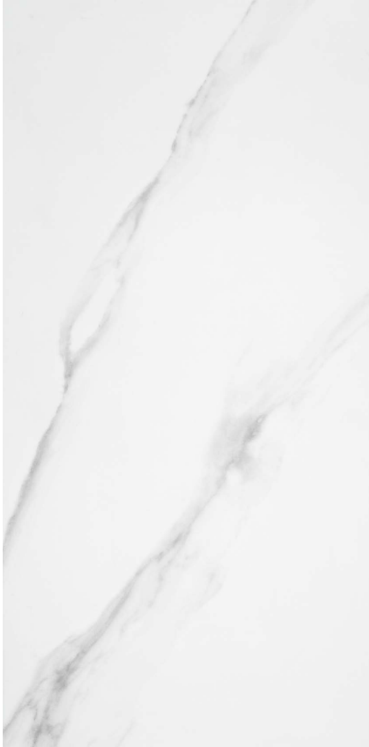
BLANCO Matte Finish

30 x 60 cm (11.82" x 23.63") UN.DM.BLC.1224.MT