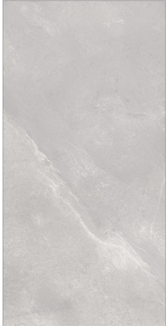
SILVER Matte Finish

33 x 33 cm (13" x 13") Thickness: 8 mm AQ.VR.WHT.1313