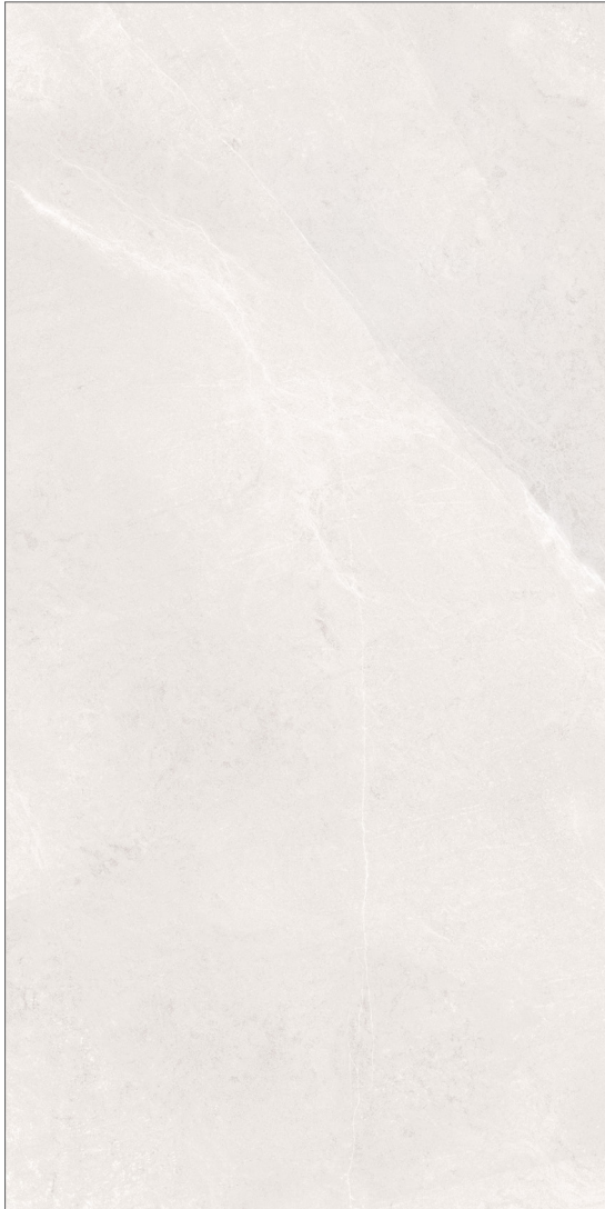
WHITE Matte Finish

30 x 60 cm (12" x 24") Thickness: 7.5 mm AQ.VR.WHT.1224