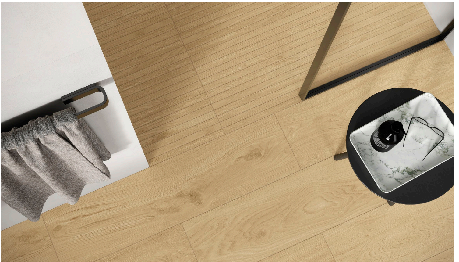
SUGAR (Light Beige)