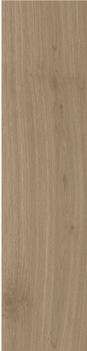
CAMEL (Beige) 22.5 x 90 cm (9" x 36") Matte Finish Nominal Thickness 8 mm WA.WD.CML.0936.MT