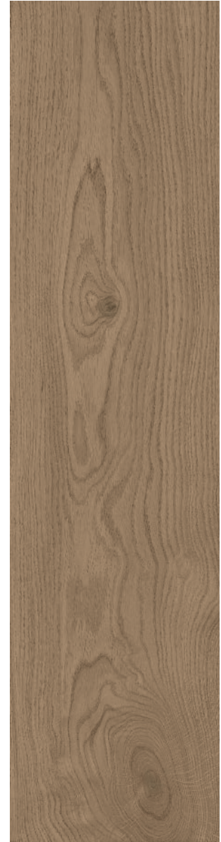
TAMARIND (Brown) 22.5 x 90 cm (9" x 36") Matte Finish Nominal Thickness 8 mm WA.WD.TMD.0936.MT

All items shown in this document are part of Olympia's stocking program. For special orders, please contact your Olympia Tile Sales Representative.