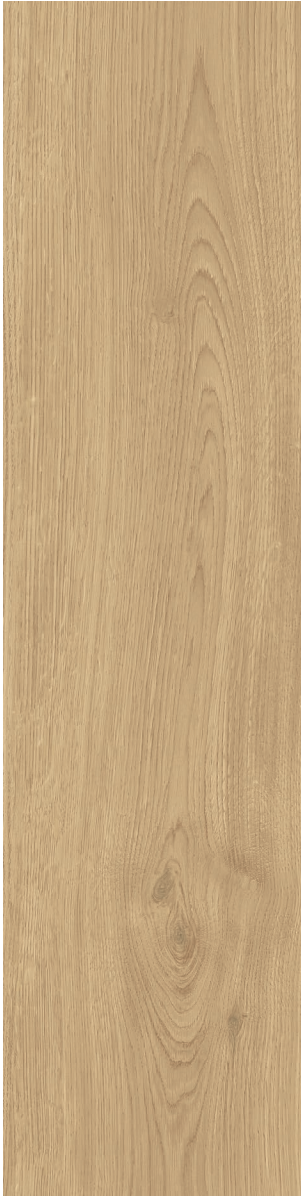
SUGAR (Light Beige) 22.5 x 90 cm (9" x 36") Matte Finish Nominal Thickness 8 mm WA.WD.SGR.0936.MT