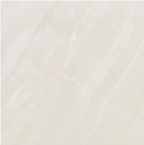
60 x 60 cm (24 x 24) Polished YS.HY.WHT.2424.PL