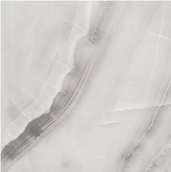
60 x 60 cm (24 x 24) Polished YS.HY.GRY.2424.PL

All items shown in this document are part of Olympia's stocking program. For special orders, please contact your Olympia Tile Sales Representative.