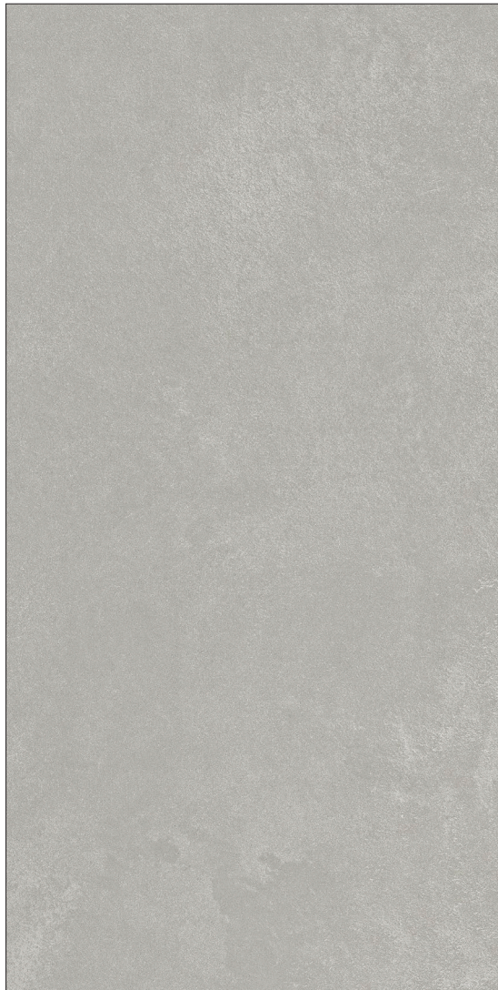
GREY Matte Finish

30 x 60 cm (12" x 24") DC.ES.GRY.1224.REC