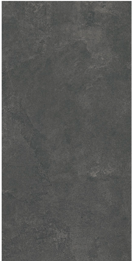
GRAPHITE Matte Finish

60 x 60 cm (24" x 24") DC.ES.GRY.2424.REC