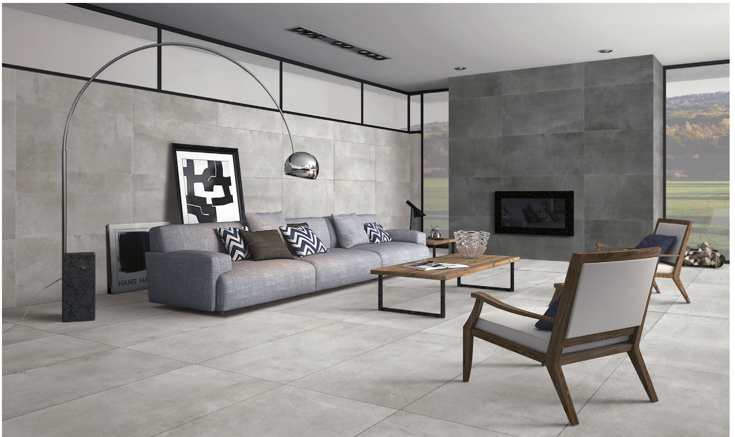
MEDIUM GREY Matte