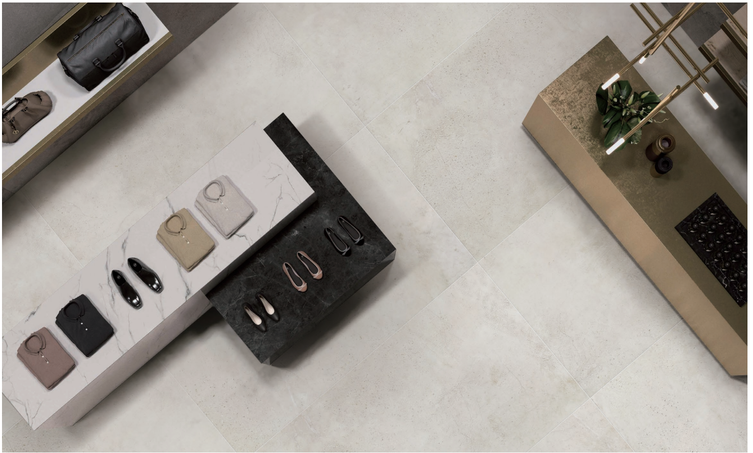
LIGHT GREY Matte