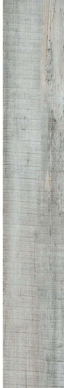
8" x 48" Matte KM.NN.EMB.0848.MT

All items shown in this document are part of Olympia's stocking program. For special orders, please contact your Olympia Tile Sales Representative.