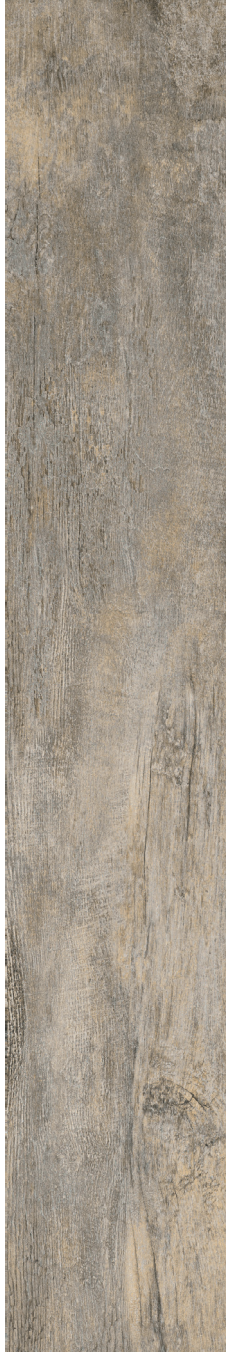
8" x 48" Matte KM.NN.HNY.0848.MT