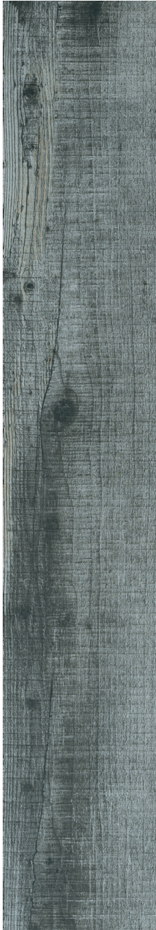
8" x 48" Matte KM.NN.CHA.0848.MT

All items shown in this document are part of Olympia's stocking program. For special orders, please contact your Olympia Tile Sales Representative.