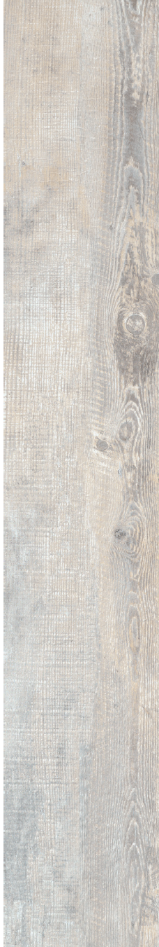
8" x 48" Matte KM.NN.DAY.0848.MT