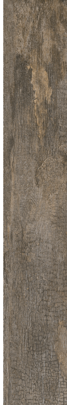
8" x 48" Matte KM.NN.BNT.0848.MT

All items shown in this document are part of Olympia's stocking program. For special orders, please contact your Olympia Tile Sales Representative.